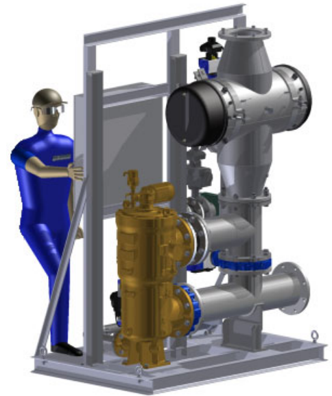
The HG250US assembly mounts major components providing the most compact solution available.